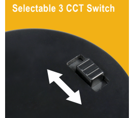
Selectable 3 CCT Switch