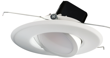
120-277V 0-10V Dimming Ver.