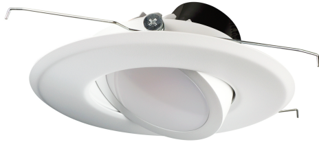
120V Triac Dimming Ver.

Use the switch to set the desired CCT (Correlated Color Temperature).